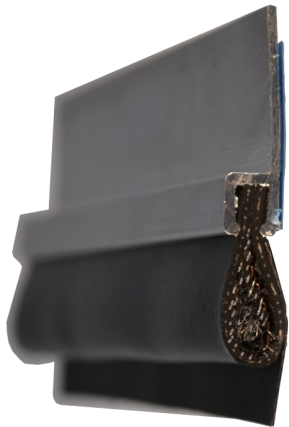
Side View of Flap & Xcluder Core