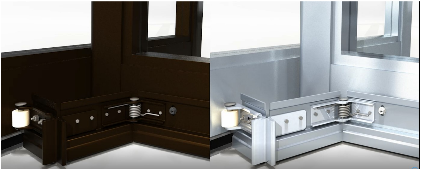
Detail view of breakout functionality - Kits available in Aluminum and Dark Bronze